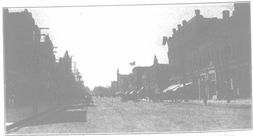
Huronario St., Collingwood, Ont. Treated with "Tarvia-B" in 1913 and 1914.

THE PATERSON MANUFACTURING COMPANY, LIMITED MONTREAL TORONTO WINNIPEG VANCOUVER THE CARRITTE-PATERSON MANUFACTURING CO., LIMITED ST. JOHN, N. B. HALIFAX, N. S. SYDNEY, N. S.