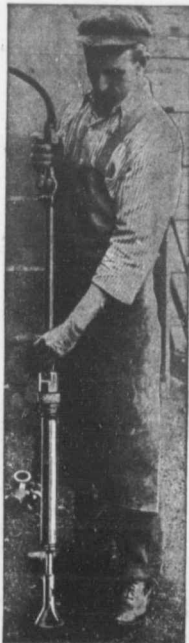
Pneumatic Sand Rammer.

Sales Offices: St. Catharines, Rossland, Vancouver, Halifax, Cobalt.