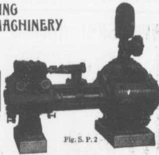
Fig. S. P. 2

The Canadian Fairbanks Co., Limited MONTREAL TORONTO WINNIPEG VANCOUVER