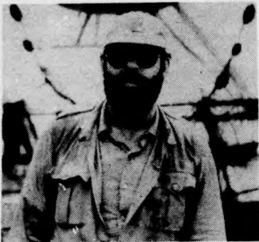
He doesn't love the smell of napalm in the morning: Francis Ford Coppola

The heart of A Filmmaker's Apocalypse is footage Eleanor Coppola, the director's wife, shot during the filming of Apocalypse Now .