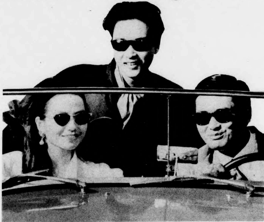
Groovy gangsters tool around Europe in John Woo's stylish Zongheng Sihai . Fine cars, fine sets, fine haircuts, fine sunglasses. All told, a mighty fine film and a fast-paced flick.

Unfortunately, the first hour or so of the film invokes a strong sense of deja vu (Kafka by way of Koestler,