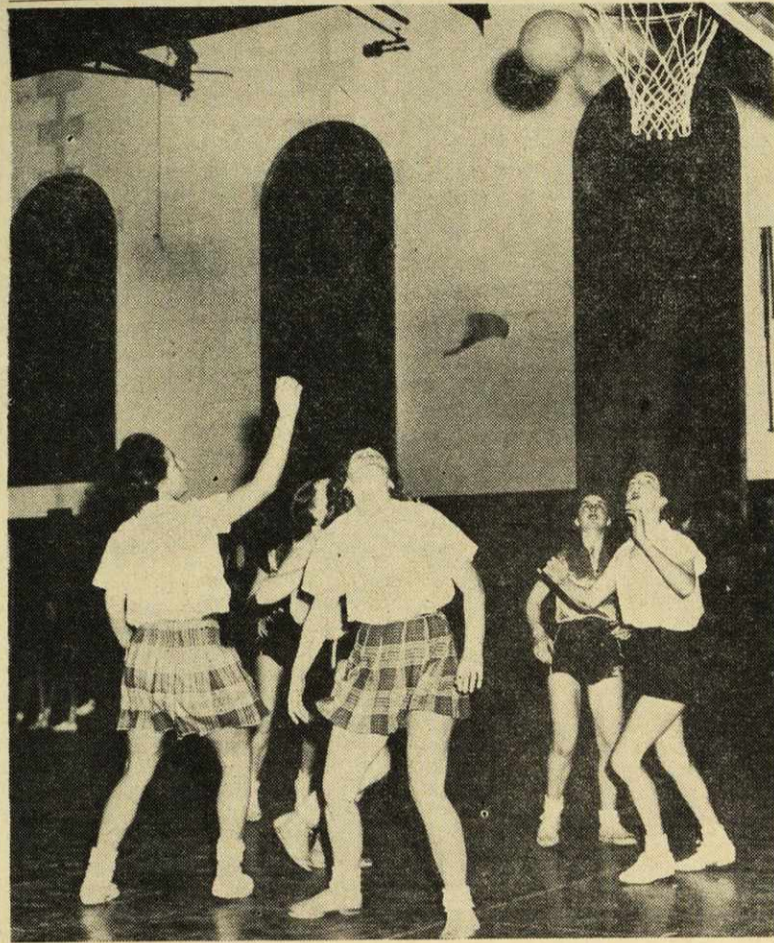
Picture above shows action during the first game in the Inter-city League when Dal Varsity met Tartans last Thursday. Dal won the game 37-22.