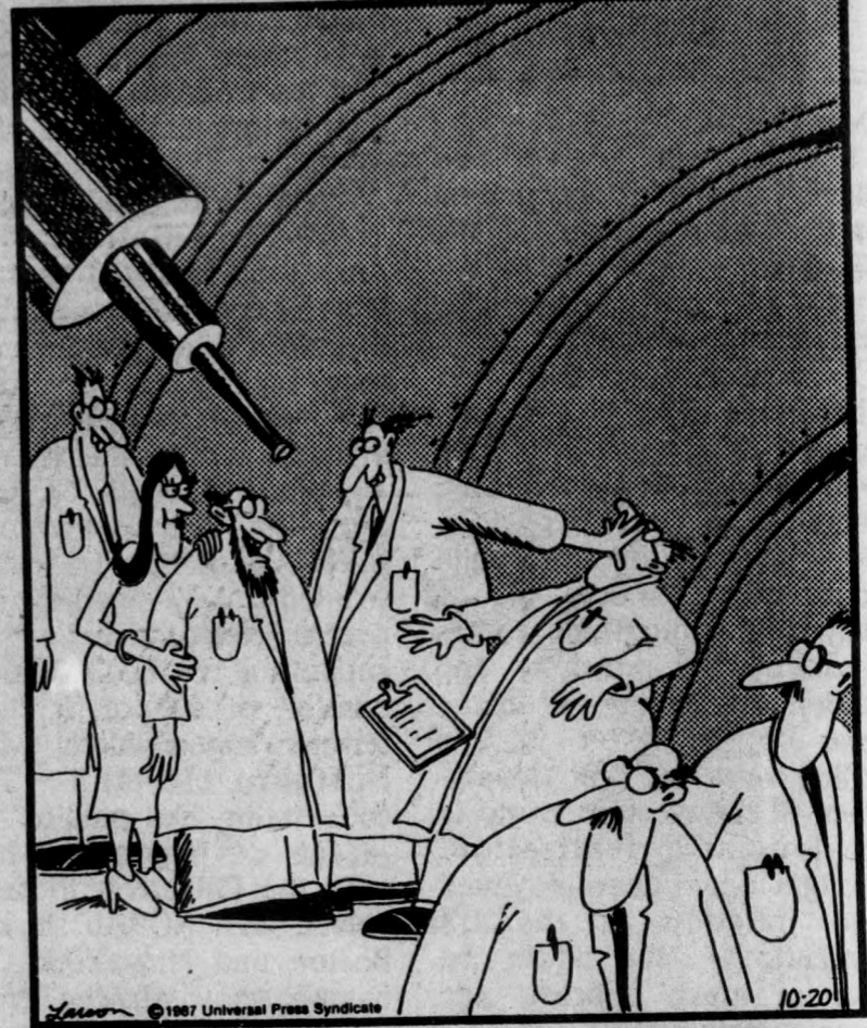
All day long, a tough gang of astrophysicists would monopolize the telescope and intimidate the other researchers.