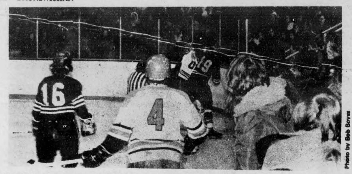
Greg Holst shows some punch, but the Devils were lacking 'scoring punch', as they tied Mt. A and were creamed by Moncton last weekend.