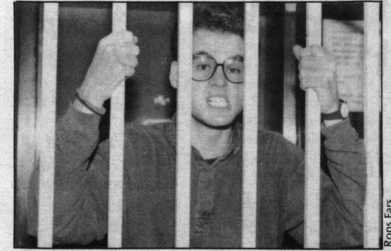
"I believe I don't like it here, I must say."