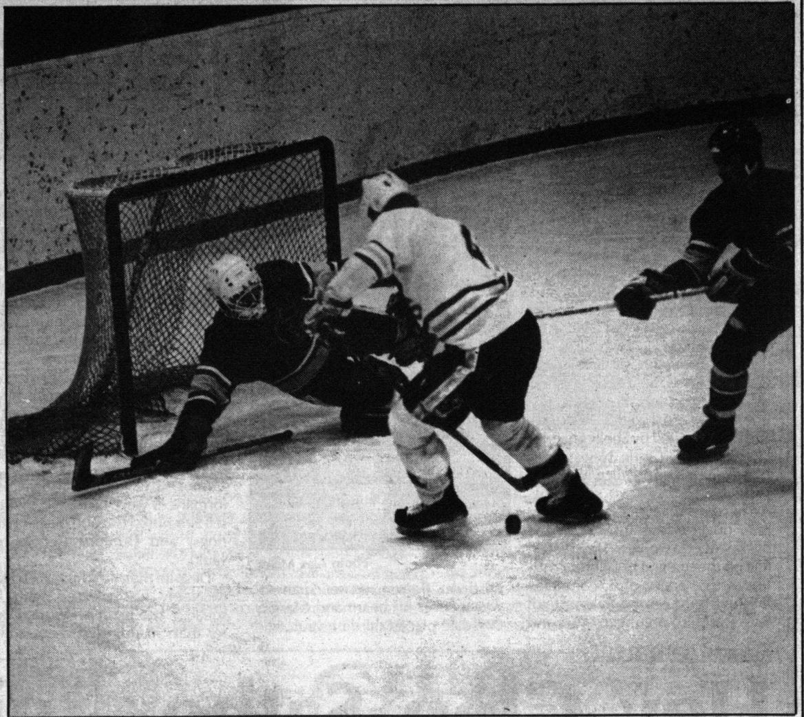
The Golden Bears took it to the Pronghorns, 8-3 and 12-5 in hockey action last weekend