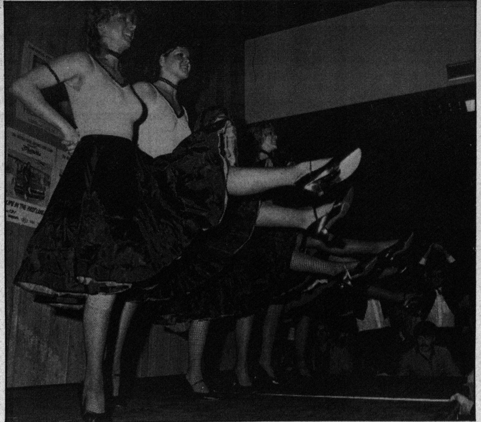
Life in the fast lane was the name of the game for these kickline specialists.