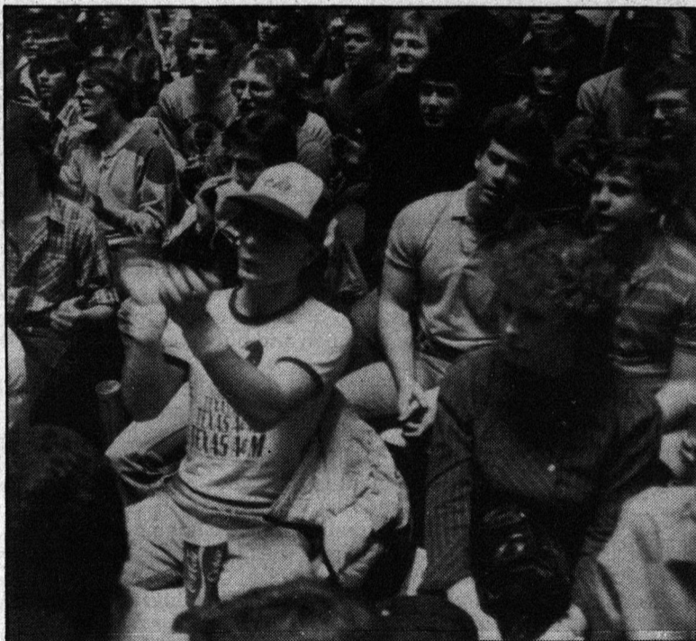
The usual crowd of redneck hosers jeered and cheered their way through an hour of mayhem