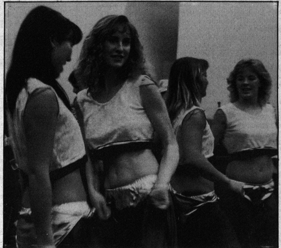
The Mineral Engineering harem waits for its chance to step into the spotlight.