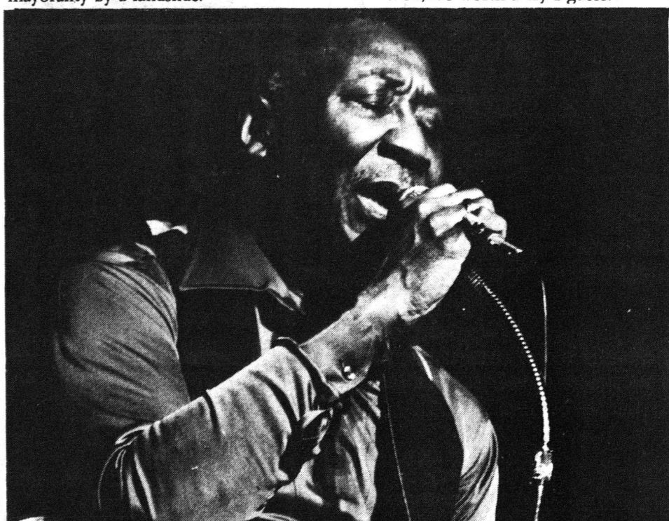
Muddy Waters electrified a SUB audience with Chicago blues.