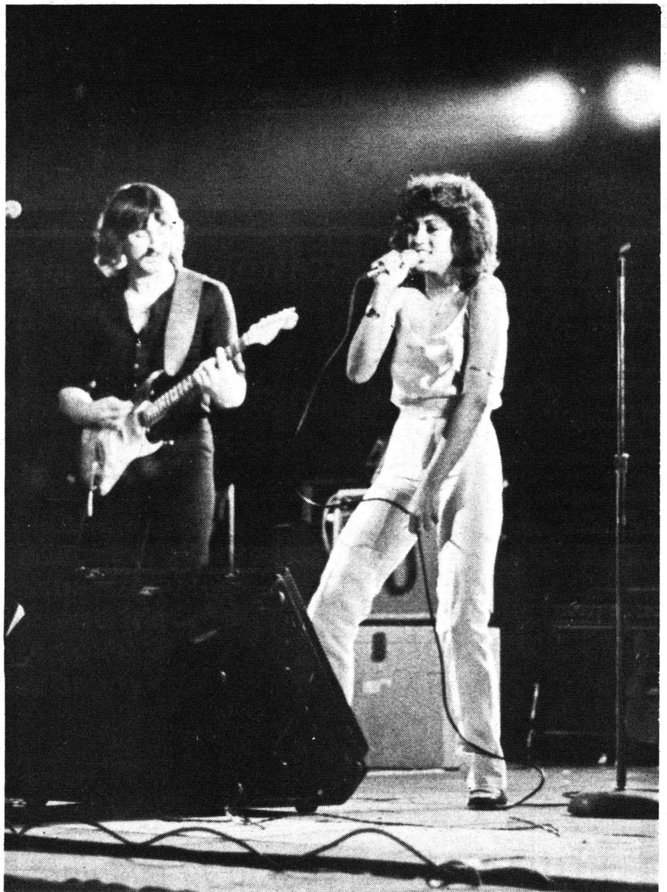
Good Tymes shake their moneymakers at a Bear Country beerbash. As usual, the washrooms were in short supply.