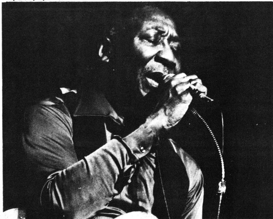
Muddy Waters electrified a SUB audience with Chicago blues.