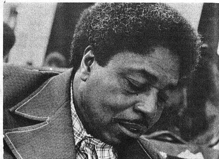
Johnny Shines' somber tones reflect his musical heritage.