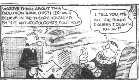
JUST LIKE A MAN—By Geue Knott

NEW GYMNASIUM SWIMMING POOL WOLFVILLE, NOVA SCOTIA