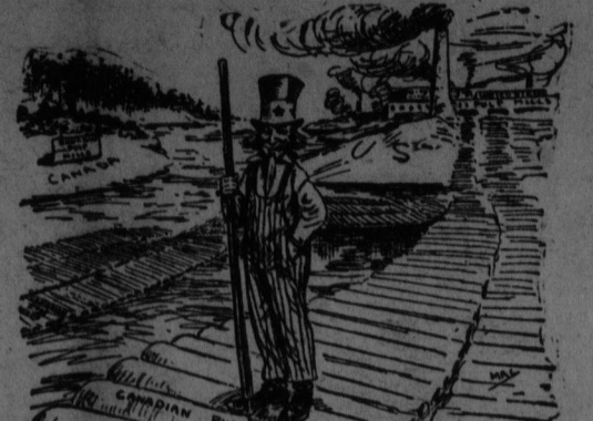
UNCLE SAM—"This is the nearest thing to having your cake after you've eaten it, I know of."

New York, June 13.—Continued inclement weather necessitated today an indefinite postponement of the third international polo match and the visit of the British players is regarded as ended.