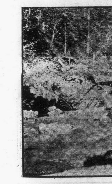
ALBERNI, COOS CREEK.