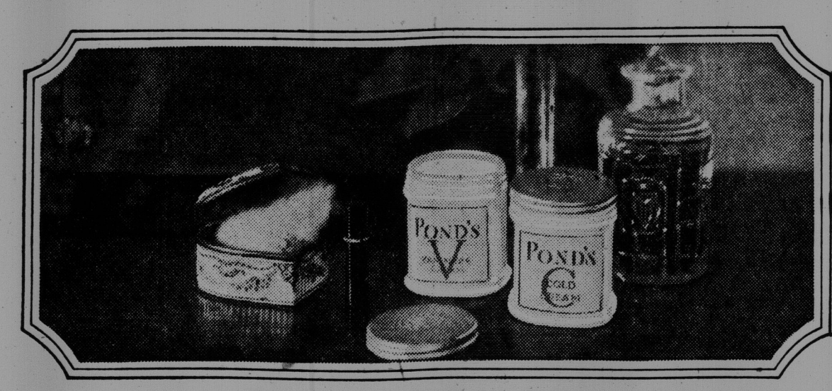
Every skin needs the deep, purifying cleansing, the delicate protection these Two Creams afford

Give your skin the rejuvenating cleansing and delicate protection these Two delicious Creams afford. Buy your own Pond's in any drug or departmental store and use them every day. The Cold Cream comes in extra large jars and both creams in smaller jars and in tubes. The Pond's Extract Company, 146 Brock Avenue, Toronto, Ontario.