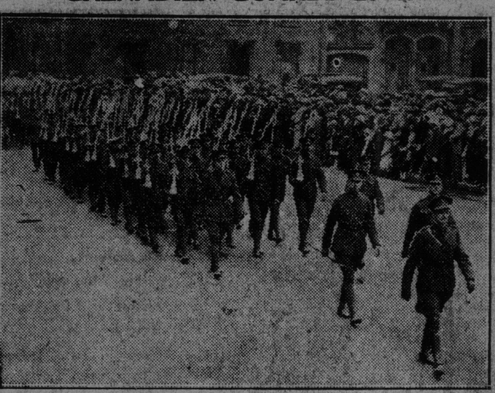
The famous 87th Regiment of Montreal welcomed home