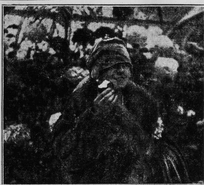
The Queen of Rumania, who officially opened Canada's National Apple Week at the time of her visit to the Central Experimental Farm, Ottawa, could not resist the tempting Canadian-grown McIntosh Red long enough to be photographed with a complete apple in her hand. The Canadian McIntosh Red, by the way, have just been declared at the Imperial Fruit Show, London, England, to have the most superior quality of any dessert apple grown in the British Empire.