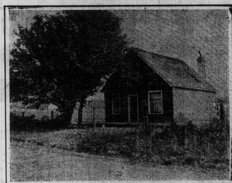
Would you like such a home as this? Here is one of our sixteen houses (it is already sold), and it represents the style of cottage you can buy for a small payment and on easy terms. If you want to build your own house, buy a lot in Regents Park, and start at once.