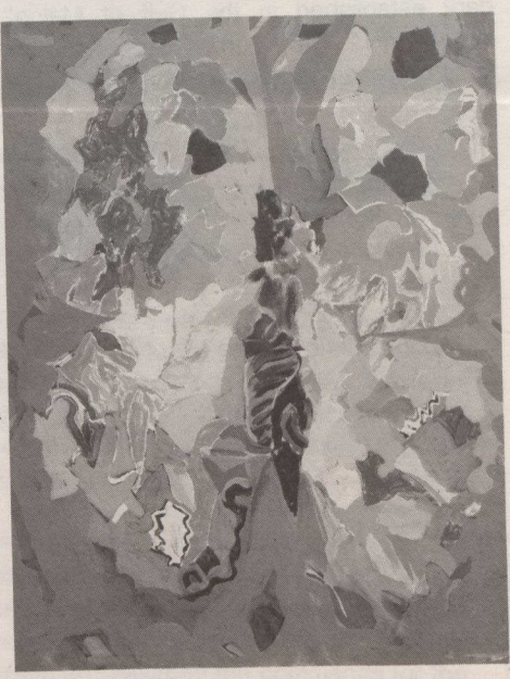
A series from the six panels in the Butterfly Transformation Theme, 1981. The butterfly is a motif common to Jack Shadbolt's work. This series is painted in vivid acrylic colours on canvas. Each panel measures 152.4 x 132.1 centimetres.

The exhibition was also designed as a celebration of Jack Shadbolt's long career as "British Columbia's most celebrated artist," said Mr. Watson. "Not only has Jack Shadbolt distinguished himself as artist,