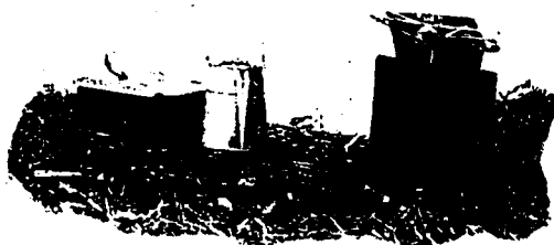
A POT ROAST.