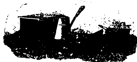
A BOILED DINNER.

Extensively used throughout the United States.