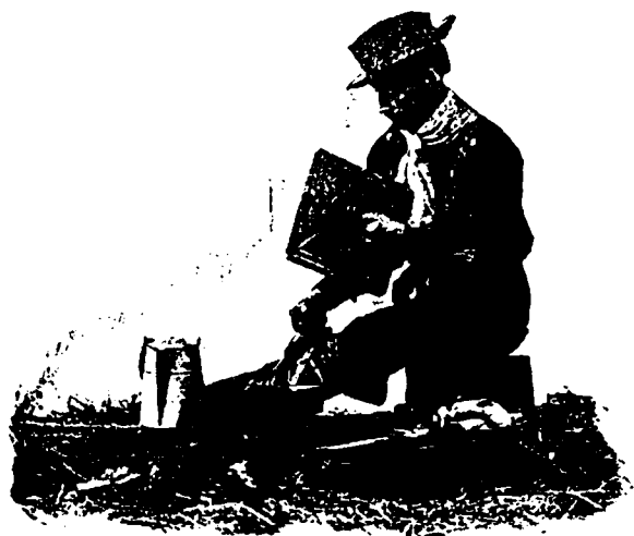
BOILING AND FRYING