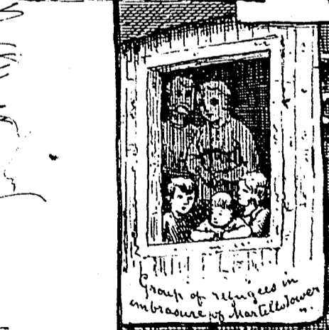
Group of refugees in embrasure of Martello tower.