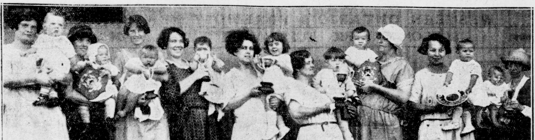
The babies in the photo are all prize winners in the various baby show events held in connection with celebration at Queen's Park yesterday. As is clearly indicated, there were some mighty fine babies competing and honors were not easily won.