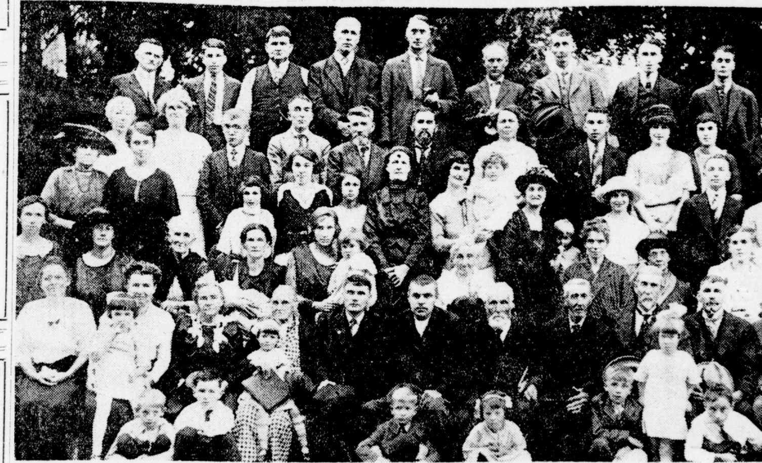
Upwards of 75 members of the Paisley family gathered at Springbank Park on Wednesday and held a most enjoyable picnic.