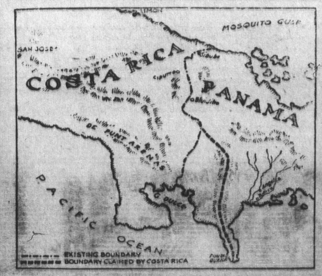
This map shows the territory in dispute between Costa Rica and Panama

Present conditions indicate that good than usual this spring.