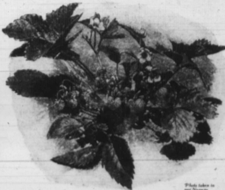
Photo taken in our Nursery

The Greatest Acquisition Yet Introduced into the West to Provide Fresh Fruit Constantly