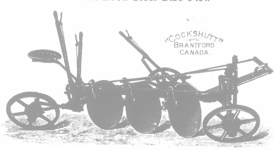
Three-Furrow Steel Disc Plow

We have given a great deal of attention to the bearings of these discs and have now produced a bearing which is perfectly smooth-running and is absolutely dust and sand-proof. Our wheel axles also are dust-proof and all possible wearing parts may be cheaply renewed. Our lever ratchets are all malleable iron, which makes possible very fine adjustments. If you have not seen a disc plow work, you would say that it does not cover stubble or trash as completely as a mouldboard plow. It rather pulverizes the ground thoroughly and leaves the surface perfectly level. For plowing clover sod they give every satisfaction, but for old sod they are not prefer-