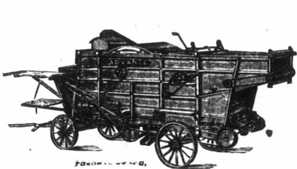
"THE TORONTO ADVANCE," IS THE MOST PERFECT THRESHING MACHINE MADE.

—HEADQUARTERS FOR— STEAM and HORSE-POWER THRESHING OUTFITS, STRAW-BURNING, PLAIN and TRACTION PORTABLE ENGINES