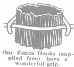
Our Fence Hooks (supplied free) have a wonderful grip.

Only one man's time and a boy's. The STANDARD Steel Tube Posts we use cost less than wood in money and service. We do a job you'll be proud of and will last longer than the boy who put them in will. We deserve your order if you want to save money.