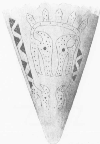
HAIETLIK, ETCHED ON WHALE HARPOON.