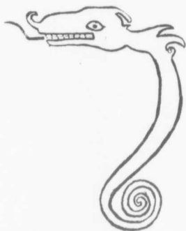
HAIETLIK, THE LIGHTNING SNAKE.