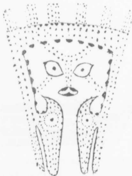
HAIETLIK, ETCHED ON WHALE HARPOON.