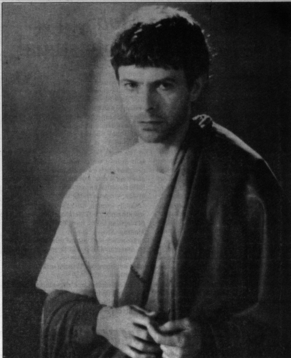
David Bowie as Pontius Pilate . . .

The makers of this movie are obviously hoping that the controversy that surrounds it will bring people flocking to the theatre. Give them what they deserve. Stay home and rent a copy of Monty Python's Life of Brian instead. It's a much more interesting messiah movie.