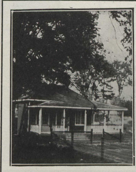
Photo of the beautiful new Bowling Green and Club House just completed in Alexandra Gardens. The club will probably be known as "The North Toronto Lawn Bowling Club,

2 oz. Tin Costs ..... 25c 4 oz. Tin Costs .....40c 8 oz. Tin Costs ..... 75c 16 oz. Tin Costs ...$1.50