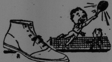
"On the Courts"

We have just what you want. See Our Windows.