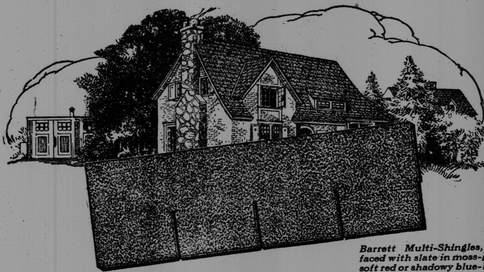
Barrett Multi-Shingles, surfaced with slate in moss-green, soft red or shadowy blue-black, increase the value of any home.