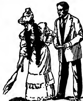
Scene in Act I,