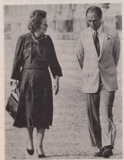
Prime Minister Trudeau (right) and British Prime Minister Margaret Thatcher walk through gardens at Versailles.

After the Versailles Summit, Prime Minister Trudeau visited Spain to discuss bilateral and multilateral issues with