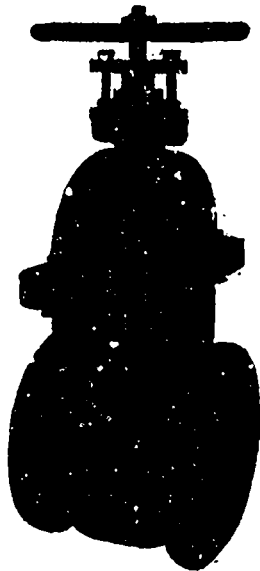
Flanged End Gate Valve with Hand Wheel.