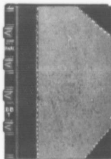
Half Leather Extra, Cloth Sides