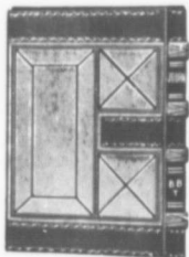
Full Board Ends and Bands 300 to 1000 Pages

Every Style, Description, Style and Pattern, make and value unsurpassed