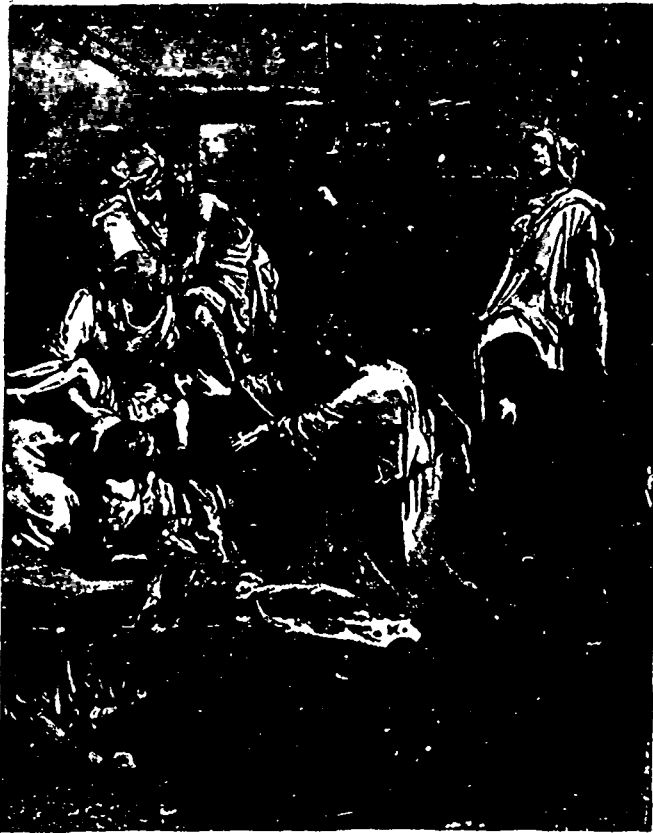
CHRIST HEALING THE AFFLICTED. Gustave Doré.

34. He healed many"—Healing "many" does not necessarily or probably imply