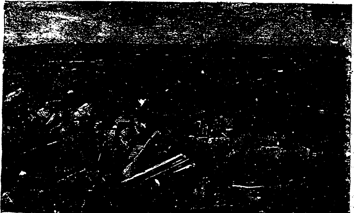
CAPERNAUM, AND THE RUINS OF WHITE SYNAGOGUE.—SEE LESSON NOTES.

Our lessons bring us again, on March 4, to our Lord's own city of Capernaum, with which so much of his public life and holy ministry was identified. Capernaum, once a busy port, at whose gate sat Matthew at the receipt of custom, is now but a mound of ruins overgrown with thorns and briars on the lonely shores of the Sea of Galilee. On a beautiful morning in April, 1890, the present writer sailed in one of the few fishing boats now upon this lovely lake along its curving shore, landed in a dense thicket of alders and visited these lonely ruins. The most conspicuous ones were those of the White Synagogue, shown in our cut on this page. It is altogether probable that this is the synagogue built by the centurion mentioned in the seventh chapter of Luke, of whom it is said, "He loveth our nation and he hath built us a synagogue." In this very building whose ruins we see it is probable that Jesus taught. It is now but