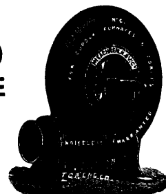
Steel Pressure Blower for blowing Cupola and Forge Fires

SANDERSON'S Tool and Drill CAMBRIA Cold Rolled and Machinery All Kinds of SHEET and PLATE