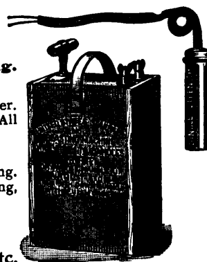
SEND FOR CATALOGUE

JAMES MACBETH & CO., 128 Maiden Lane, New York, U.S.A.