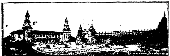
FIG. 2140. THE PLAZA.

The illustration herewith shows the western end of the Propylæa. This is an architectural ornament of very beautiful and imposing design. It marks the northern boundary of the Plaza, and is designed as a screen, separating the Exposition from the noise and smoke incident to the traffic of steam railways which pass the Exposition grounds upon the northern side. The Propylæa is 500 feet long with a massive towered entrance at each end.