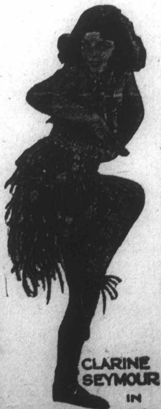
CLARINE SEYMOUR IN D.W. GRIFFITH'S 'THE IDOL DANCER'

There's many a smile and hearty laugh in it