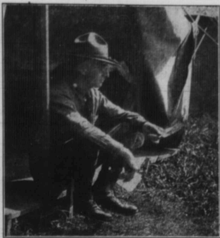
The Picture from Home

Keep your Kodak busy for the sake of the boys "over there"