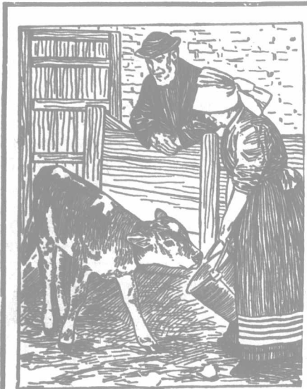
BIBBY'S CREAM EQUIVALENT