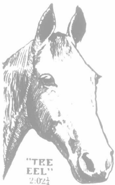
"THE EEL" 2024