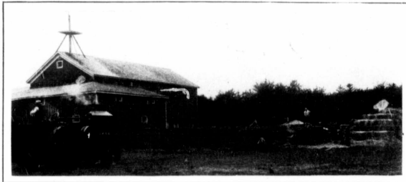
Case 60 Oil Tractor - Case Steel Baling Press

There is no machine that contributes so easily to your profit account as the Hay Press. Because—