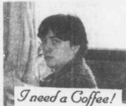
I need a Coffee!