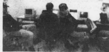
We're an equal opportunity employer!

If you're willing to accept the challenge, keep in mind that you need not contribute to every issue, we're willing to work around your schedule and you become a full-fledged sports staffer after contributing to 3 big issues. If you're interested phone 453-4983 and ask for Sports staff.