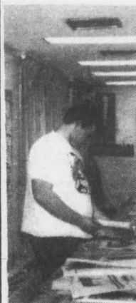
I don't care!

The paper hits the streets and the shit hits the fan. Just think, at noon, it all begins again.