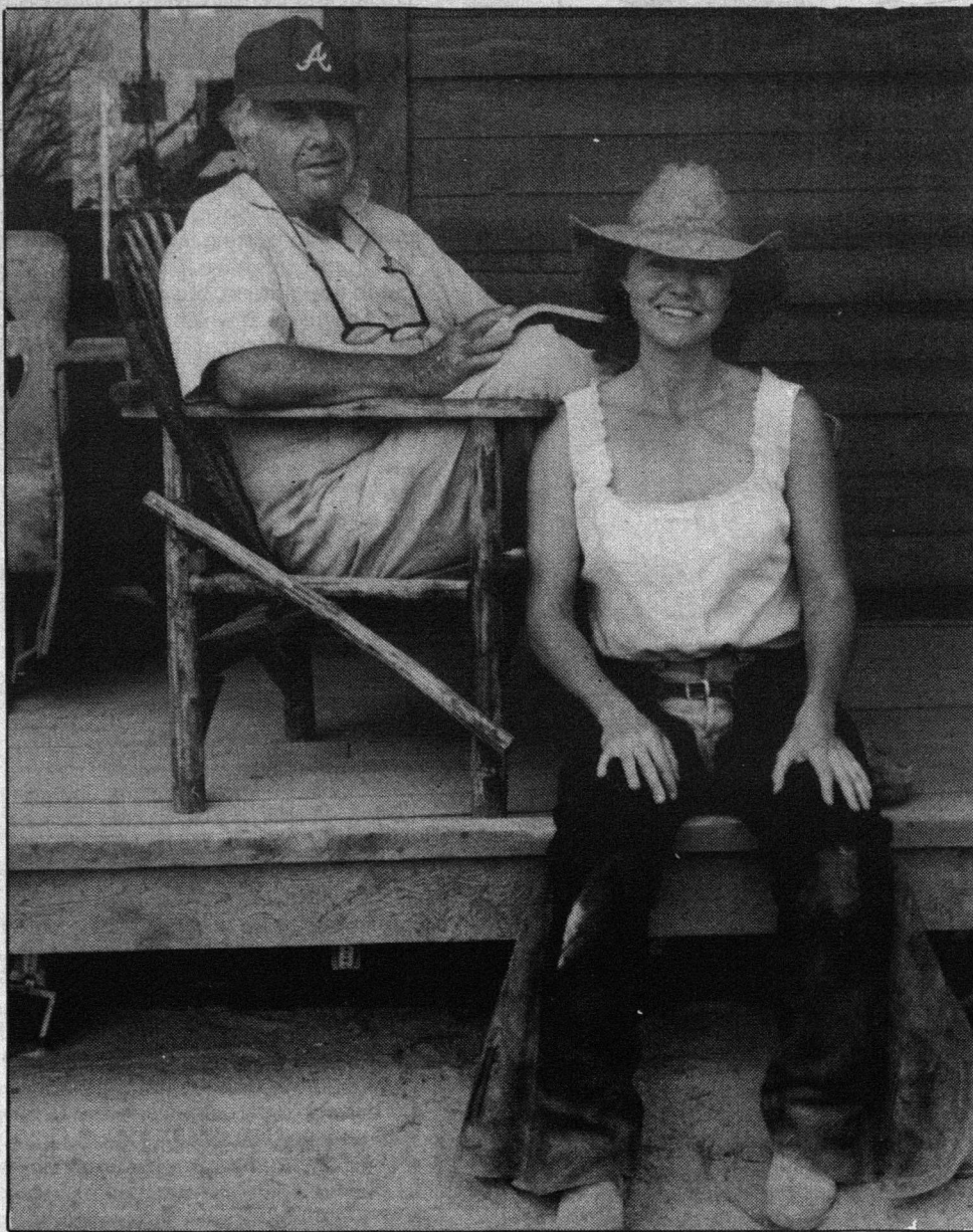
Sally Field and director Martin Ritt on location for Murphy's Romance .

She's besieged on the other side by an ex-husband who comes back to leech off her, spending her bingo money on beer and