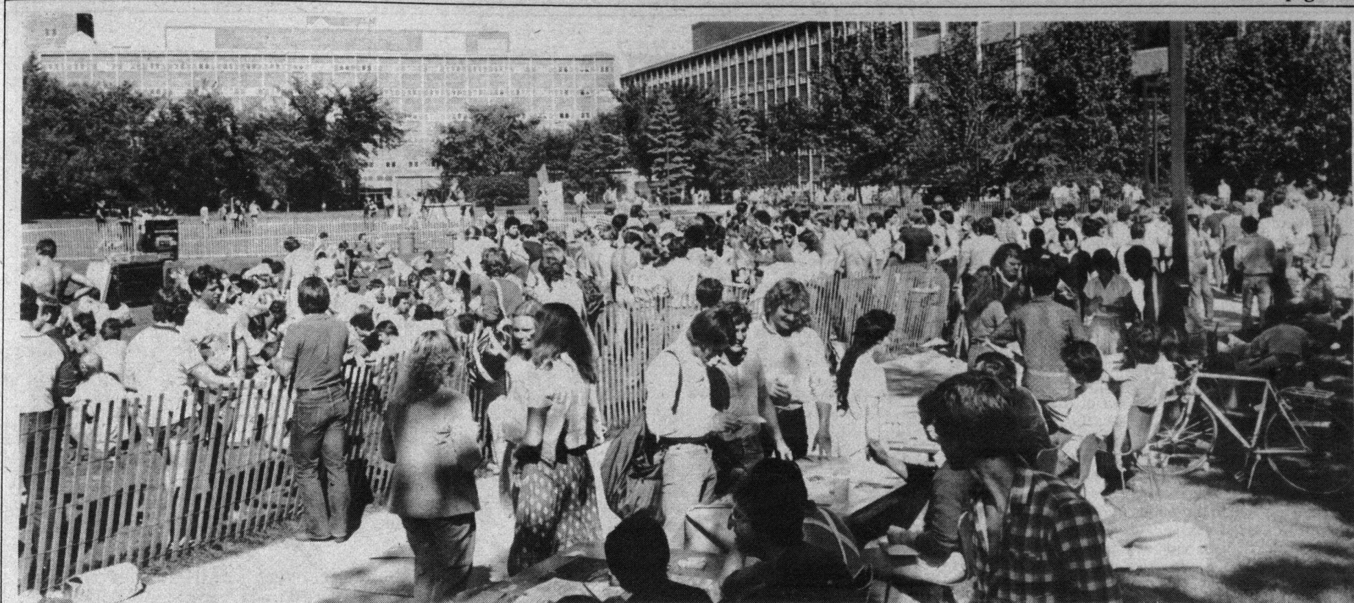
Thousands came out to enjoy the Festivities in Quad all week.