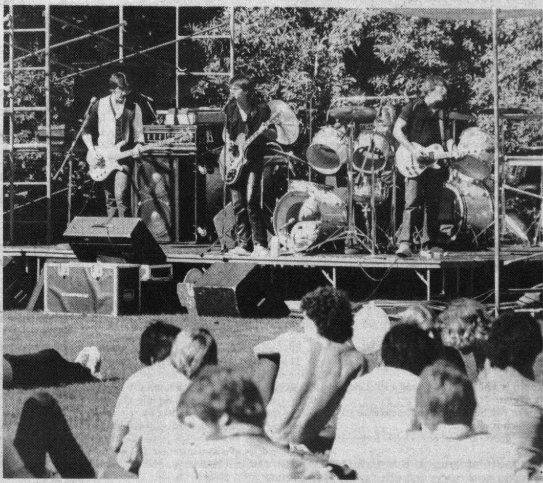
Wow! Live music with no cover charge.